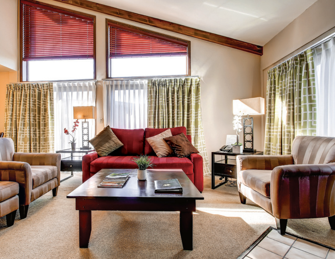
sample of 1 bedroom suite