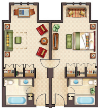
samples of 1 bedroom suites