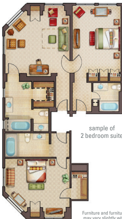
sample of 2 bedroom suite

Furniture and furniture placement may vary slightly with each suite.